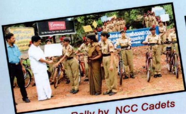
Awareness Rally by NCC Cadets