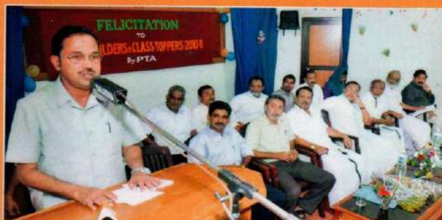
V C Felicitates the Rank holders