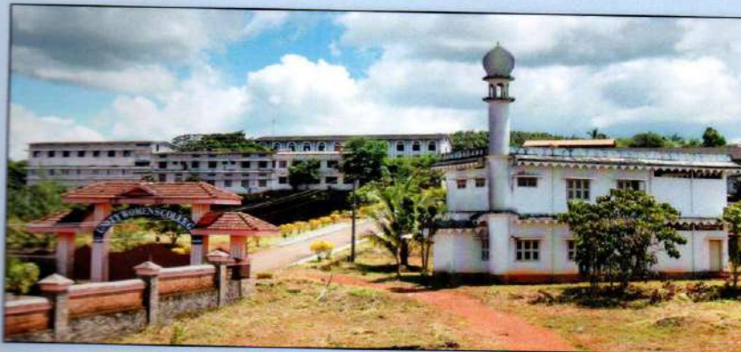
Narukara campus (2008)