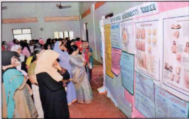
Exhibits in Workshop