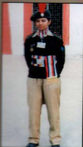
Best cadet at