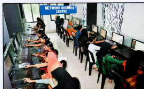
Network Resource centre