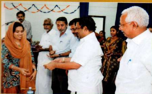
Awarding the Rank holder