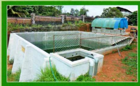
Rain harvest Tank & Net House