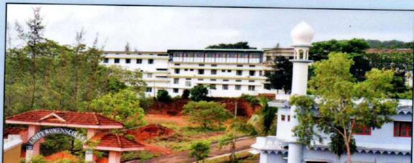
Narukara campus (2012)