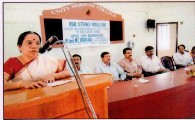
Legal literacy class