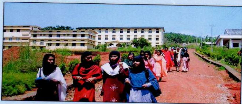
New campus at Narukara (1996)