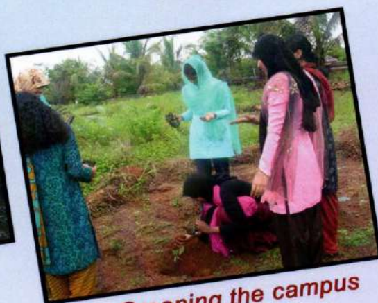
Greening the campus