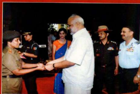
Chief ministers Best ANO award