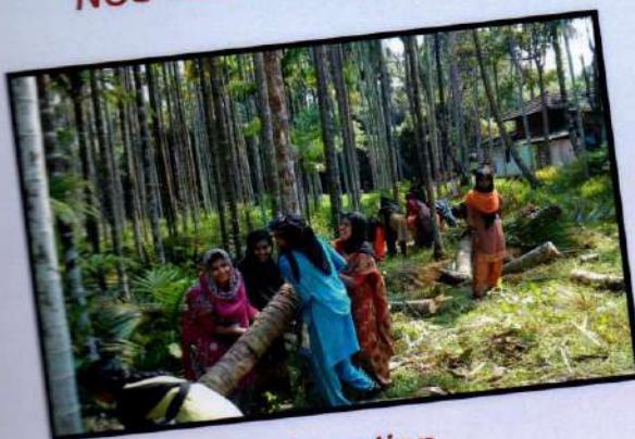
NSS units in action