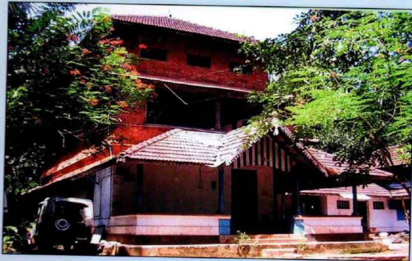
College Old Building (1991)