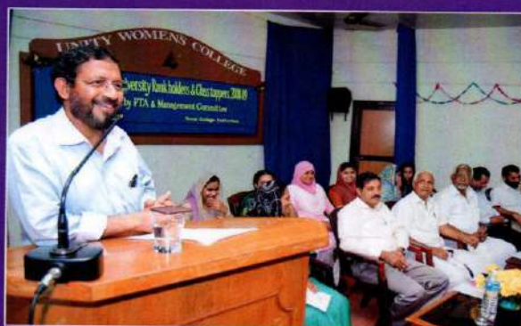
Felicitation to Rank holders