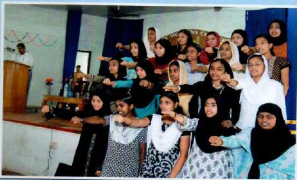
Students' union - Oath taking