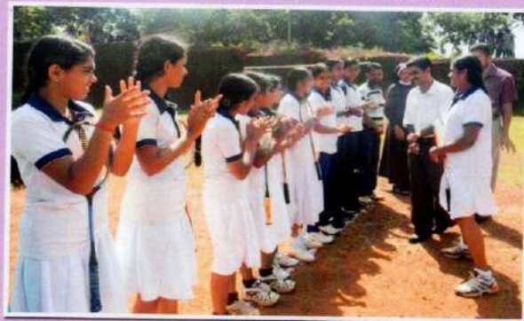
Inter collegiate Ball badminton Championship