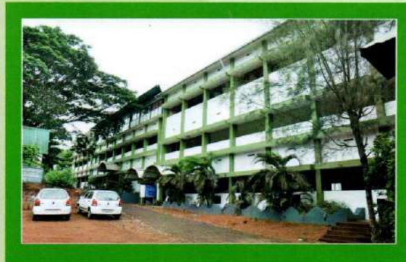
Administrative & Computer science block