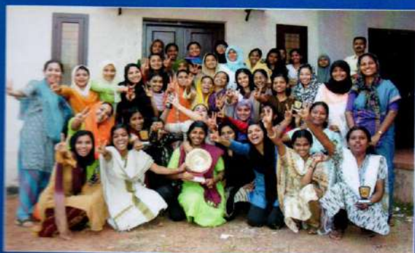
C - Zone Runner's up